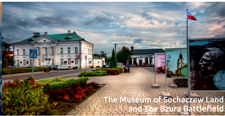
The Museum of Sochaczew Land and The Bzura Battlefield