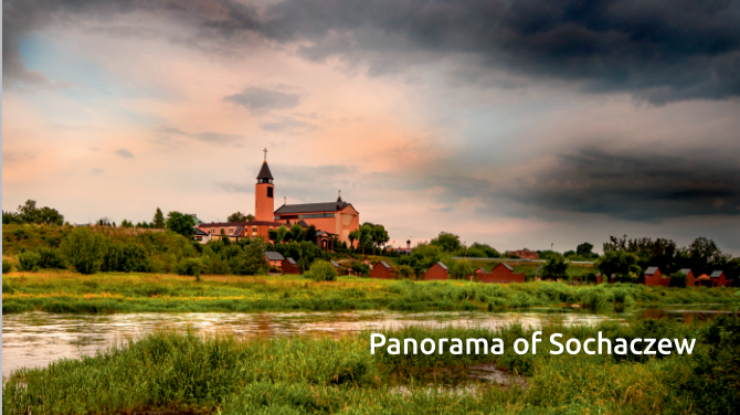
Panorama of Sochaczew