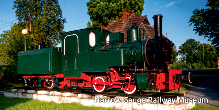
Narrow Gauge Railway Museum