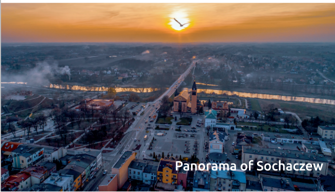
Panorama of Sochaczew

A great place for walking and recreation for the whole family is Ignacy Włodzimierz Garbolewski Park. It's a typical example of a 19th century court garden with a pond. The whole area has recently undergone a thorough revitalization: greenery was taken care of, there are new, but historically reflected, walking paths with summer stage and summer garden were set up. Everyone can start their adventure with music here, especially considering the fact that near the historic manor house, there is the State Music School named after F. Chopin.