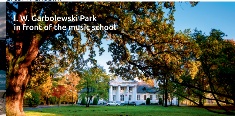
I. W. Garbolewski Park in front of the music school